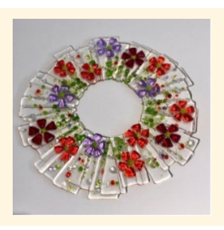
Beginners Fused Glass Wreaths