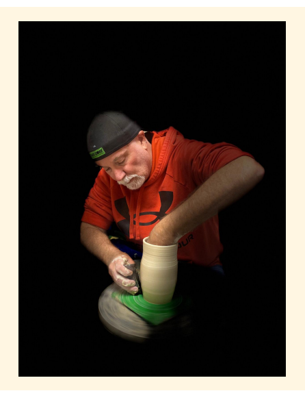
Beginning Wheel Throwing - Cylinders